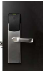
VingCard Classic RFID