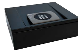
Elsafe Zenith Range