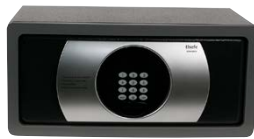
Elsafe Sentinel II