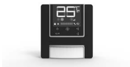
Orion High Voltage Thermostat