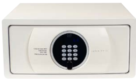
Elsafe Infinity II

Our safes share technology with our electronic locks enabling Visionline to operate both product lines within the same solution.