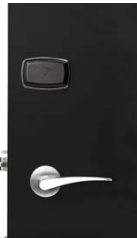
VingCard Signature RFID