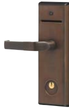
Dark US Antique oil rubbed