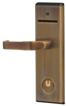
US Antique oil rubbed