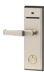
Velour Nickel with polyester